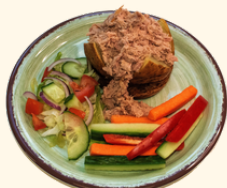
Tuna Mayonnaise (F.E)