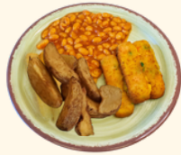
(vg) Garden Vegetable Fingers (G)