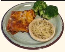
(h) Beef Lasagne (G.D)