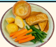
Roast Chicken Fillet Yorkshire Pudding (G.E.D)