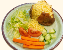
(v) Cheese (D)