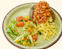
(v) Cheese/Beans (D)