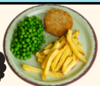
Salmon Fishcake (F.G)