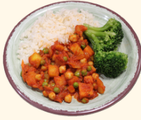
(v)(h) Vegetable Curry