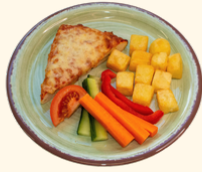
(v) Cheese & Tomato Pizza Wedge (G.D)