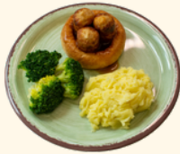
(v) Plant Power Toad in the Hole (G.E.D)