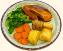
(vg) Quorn Roast Stuffing ball (G)