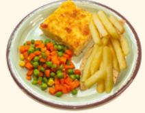
(v)(h) Cheesy Omelette (E.D)