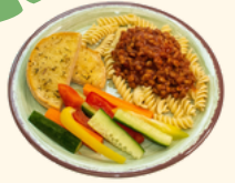
(h) Beef Bolognese (G.D)