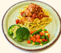
(v)(h) Chines Style Quorn (E)