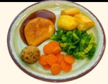
Roast Chicken Fillet Stuffing ball (G)