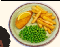
Battered Fish Fillet (F.G)