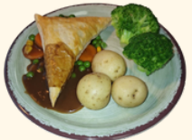
(v)(h) Vegetable Pie (G)