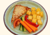
(v) Cheese & Tomato Pizza Wedge (G.D)