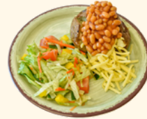
(v) Cheese/Beans (D)