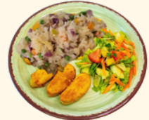
(v) Quorn Dippers (G)