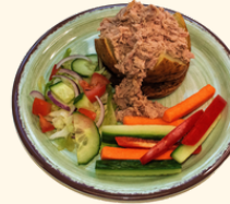
Tuna Mayonnaise (F.E)