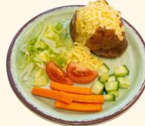
(v) Cheese (D)