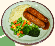
Pork Sausages (G.SU.SB.D)