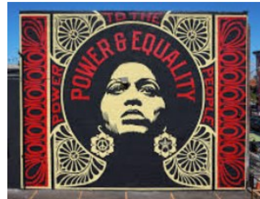
Frank Shepard Fairey