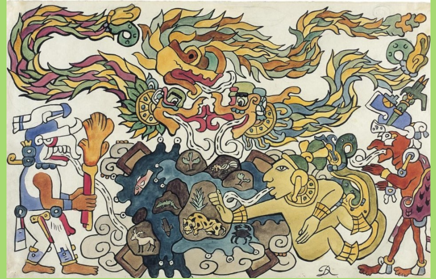
Diego Rivera - Creation of the Earth