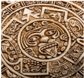
Maya art and Wayob symbols

Sculpture - To form an image or representation of from solid