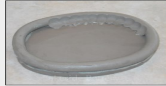
Pinch coil into slab on the inside