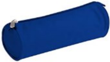
A fabric pencil case that closes with a zip.

Pencil cases can be made from lots different materials, including: fabric, wood, leather, metal and plastic. Fabric pencil cases are usually fastened with a zip but they can also be fastened with buttons, Velcro or poppers.