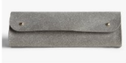
A leather pencil case that fastens with poppers.