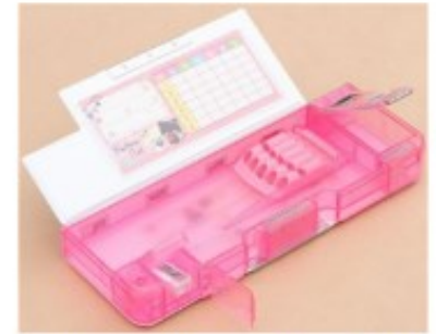
A plastic pencil case with multiple compartments.