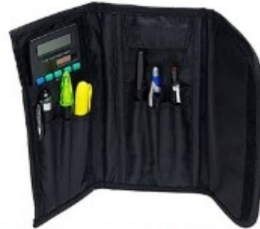
A fabric pencil case that folds closed and is fastened with Velcro.