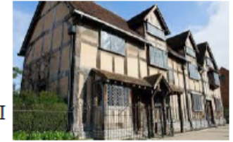
Shakespeare's birthplace, Stratford-upon-Avon

William Shakespeare was a famous poet, playwright and actor. He wrote many plays including Romeo and Juliet and A Midsummer Night's Dream. Stratford-upon-Avon is the town where William Shakespeare was born and is buried. Shakespeare was born during the Tudor period when Elizabeth I was queen.